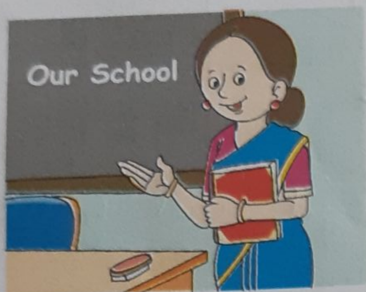
She is our class teacher.