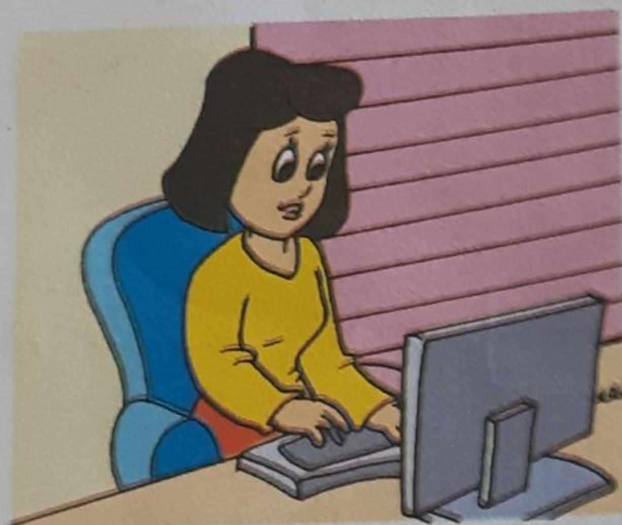
She is our receptionist.