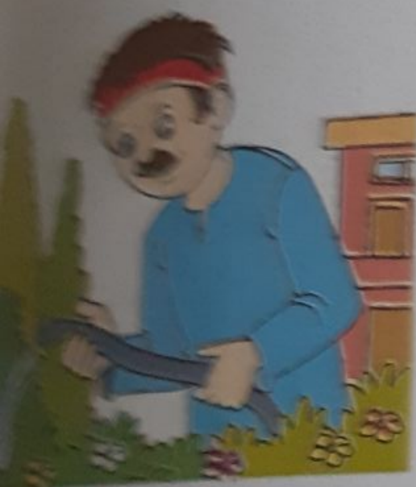
He is our gardener.