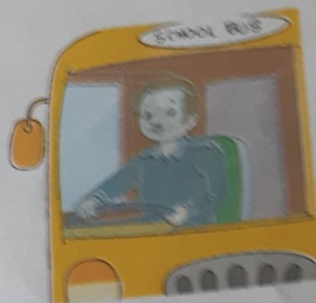
He is our bus driver.