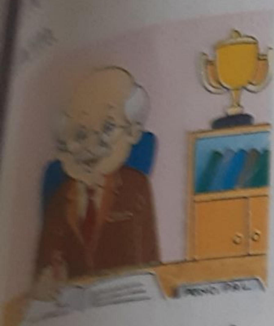
He is our Principal.

...play games... ...learn to sing and dance. We learn about animals and plants. ...learn to care for them. We learn good manners. We celebrate ...birthdays of our friends at school. We learn to share ...with our friends. We also make friends and have fun. ...are many people who work at our school. I want you to meet