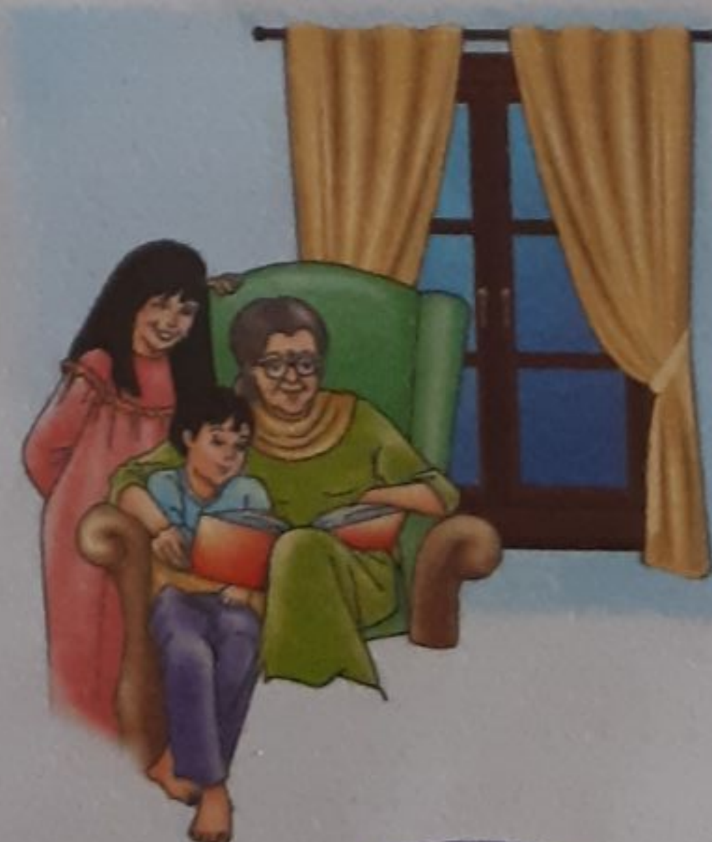
Grandma is telling a story.