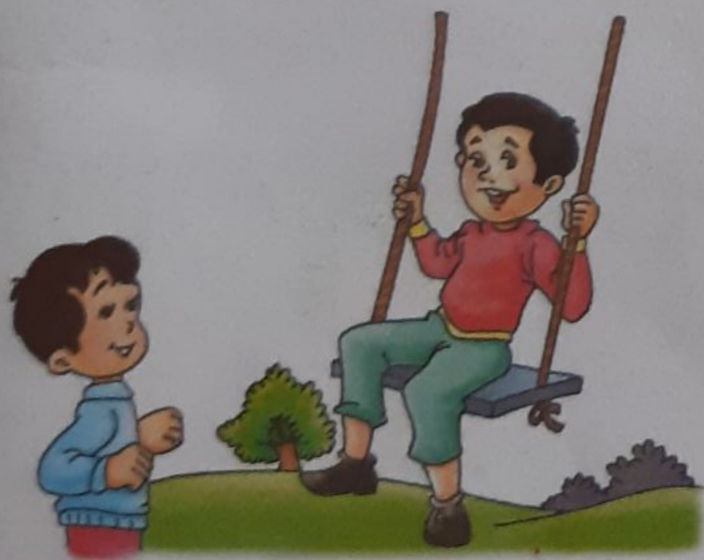
Children are playing.

B Look at the picture and circle the words that show what they are doing.