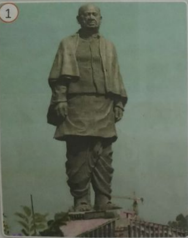
.....Statue of Unity.....