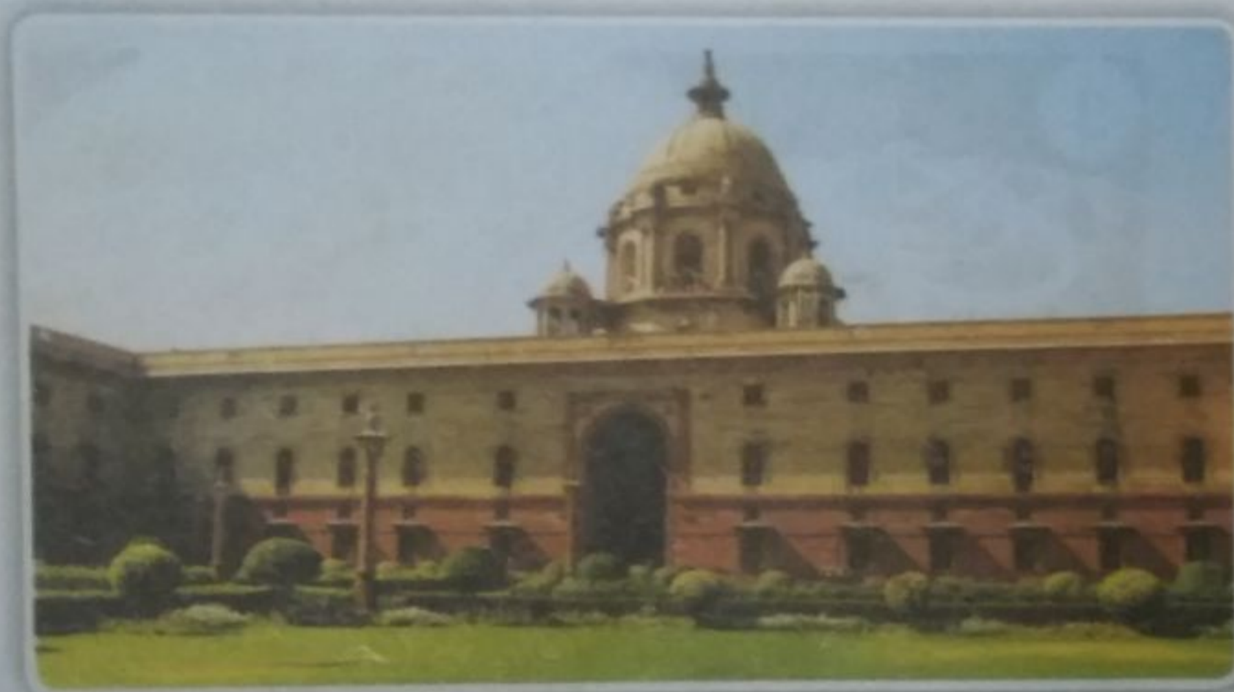
Rashtrapati Bhawan: It is the residence of the President of India, in New Delhi.